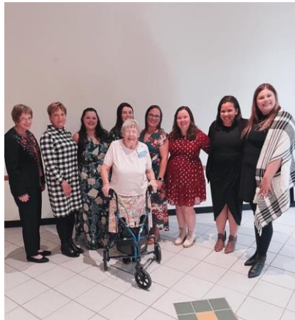
Founder's Day 2022

We are so excited to be ushering in a new decade of the Fairfax County Alumnae Chapter after our 10 th anniversary in 2022. In this new decade, we want to know what our members are looking to gain out of their membership experience. Covid-19 has changed our outlook on events and gatherings for better or worse. And we have seen a direct impact in the attendance rates of our events since the pandemic hit its height in 2020.